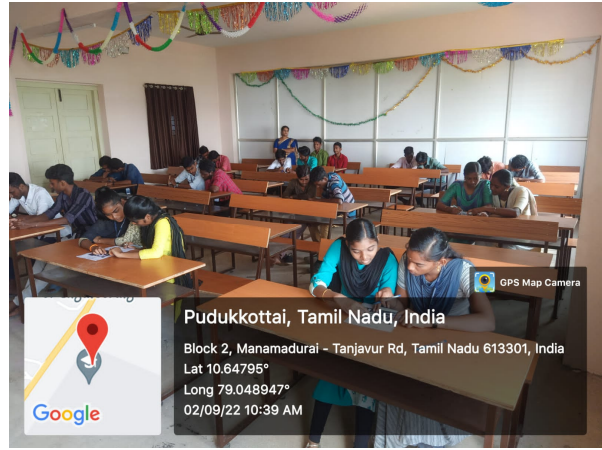
Participants actively solving the crossword