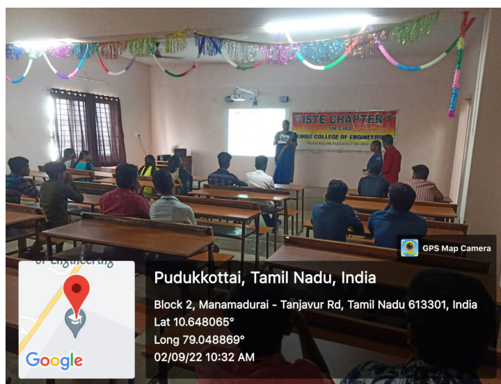
Ms.D.Shrividhya explaining the guidelines about the competition

The skill of effective problem solving is a valuable and important one. Crossword Puzzles teach students to use their own minds to figure out how to solve problems and think in a logical way.